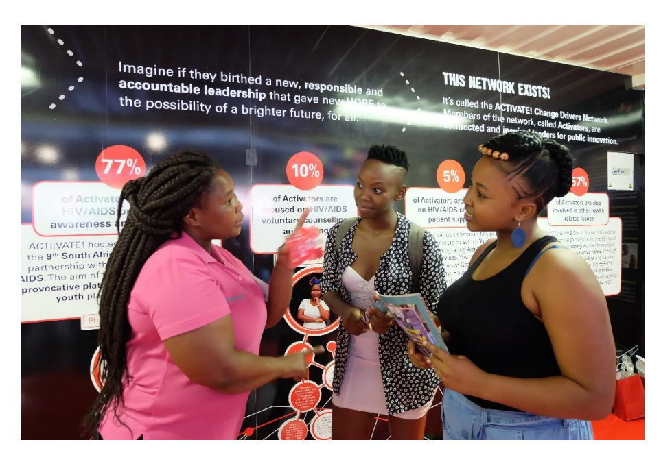
Through targeted activities such as here in South Africa, young people can be reached in the places where they socialise.

Children and young people often make up a large proportion of the population in fast-growing societies. Girls are frequently exposed to particular risks in these contexts, through teenage pregnancy and sexual violence. With