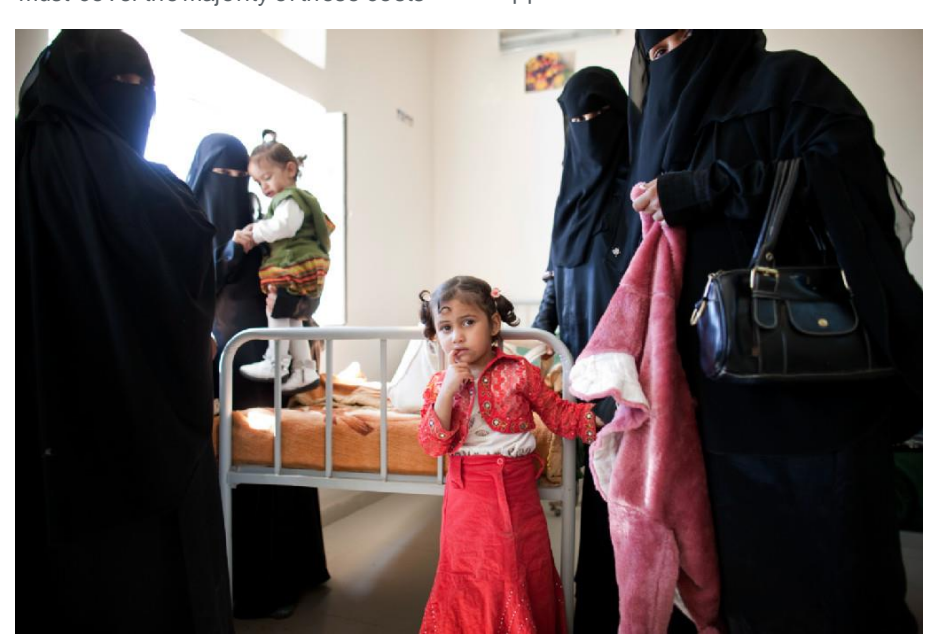
In Yemen it was possible to significantly improve mother and child care using voucher schemes.

In industrialised countries with a well developed private sector, reproductive health services can be provided privately to a considerable extent. To ensure that lower-income service recipients have access to these services, however, the lower market segments need to receive support from the state or receive