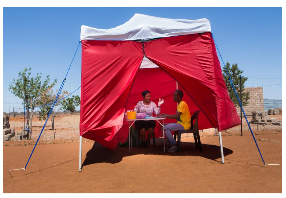
At mobile consulting stations, HIV tests are offered alongside other services.

The aim of social franchising is to improve access to quality-assured SRHR services through partnerships with healthcare facilities. To enable this, the project team provides advanced training on reproductive health to doctors and medical staff. In return, the clinics undertake to uphold medical standards, to use quality-assured materials and to