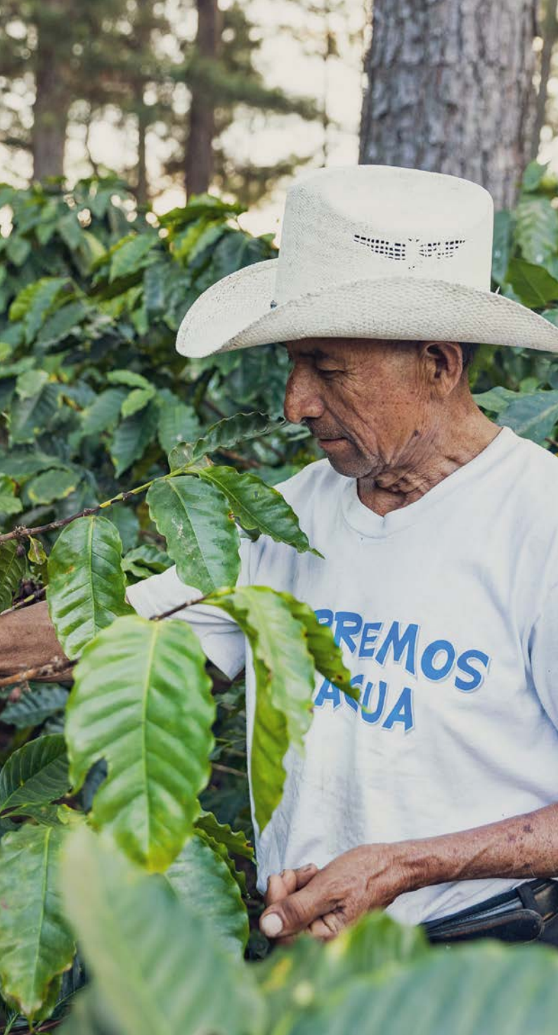
Coffee farmer in Guatemala