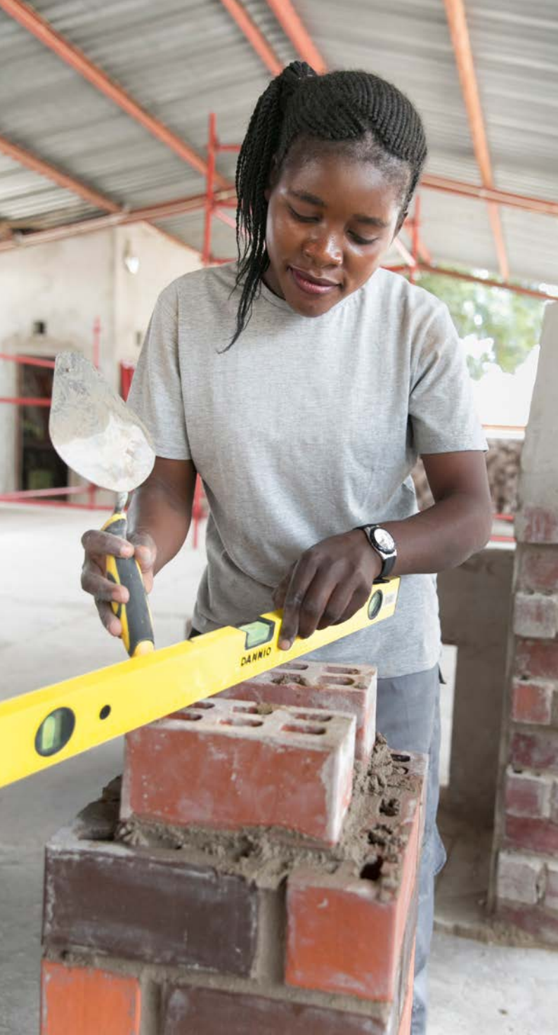
Vocational training in Zambia