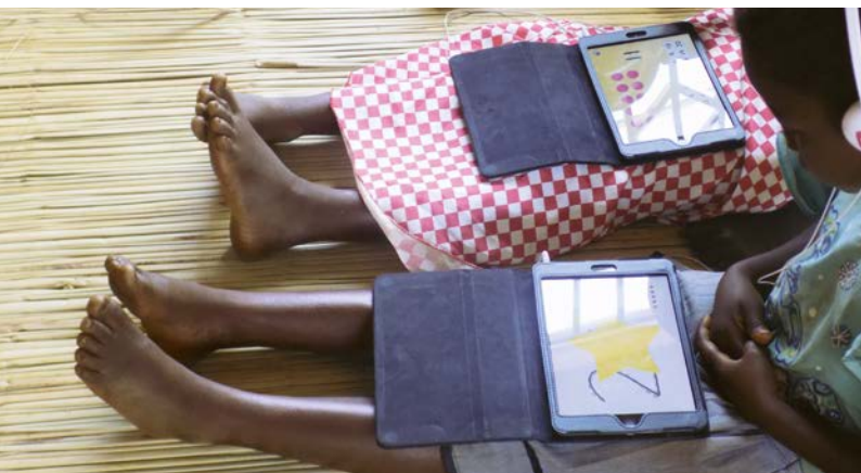
Primary school children in Malawi receive additional lessons on IT-tablets

As part of the Federal Ministry for Economic Cooperation and Development's Special Initiative for Training and Employment, KfW Development Bank established the Investments for Employment FC facility in November 2019. Almost EUR 98 million of the Federal Ministry for Economic Cooperation and Development's cash funds were paid into the facility in December 2019, a figure expected to rise as high as EUR 400 million in the future. Competitive rounds will be launched to finance job-creating investments in the Federal Ministry for Economic Cooperation and Development's six reform partnership countries, with Rwanda and Egypt also to be included among them in the future. In total, the special initiative is intended to create up to 100,000 jobs and 30,000 traineeships.